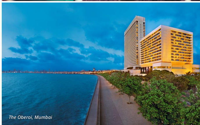
The Oberoi, Mumbai