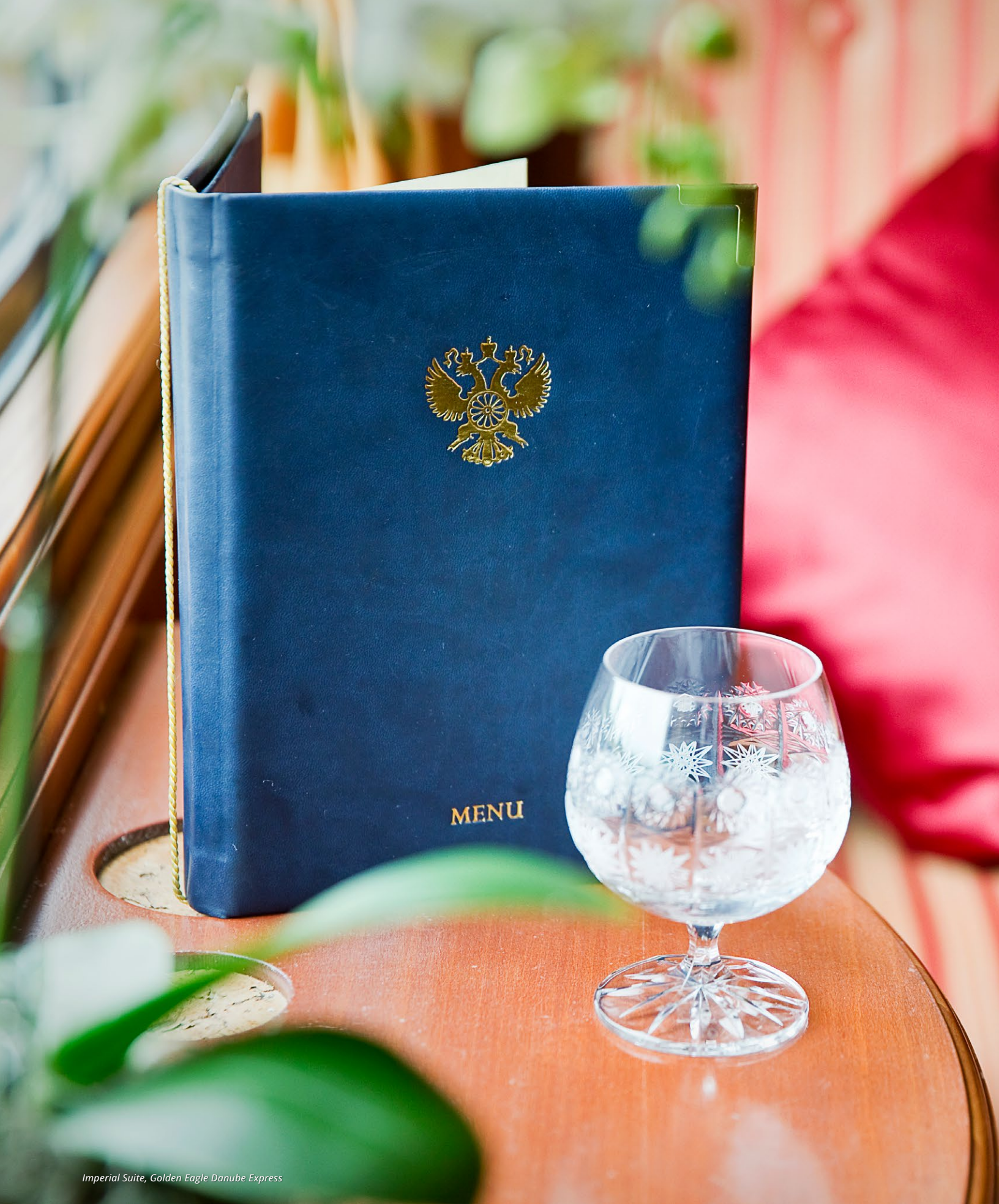
Imperial Suite, Golden Eagle Danube Express