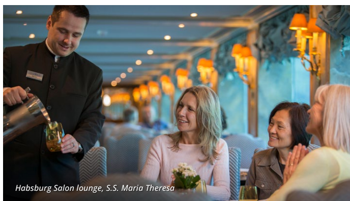
Habsburg Salon lounge, S.S. Maria Theresa