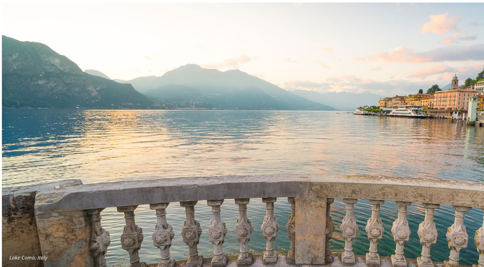
Lake Como, Italy

15 Days • Passau to Venice • S.S. Maria Theresa & Golden Eagle Danube Express