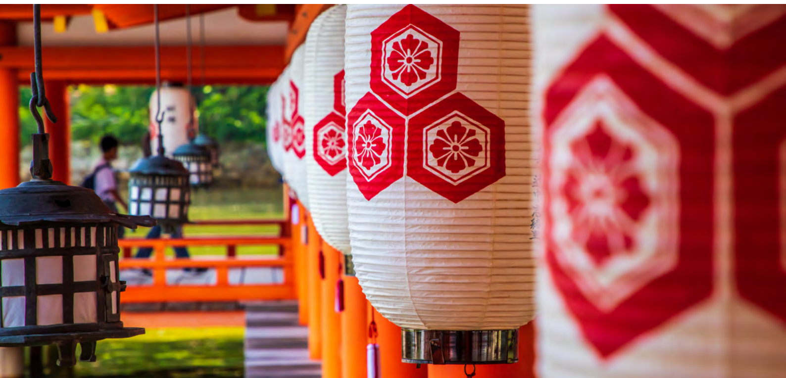
Itsukushima Shrine, Hiroshima, Japan