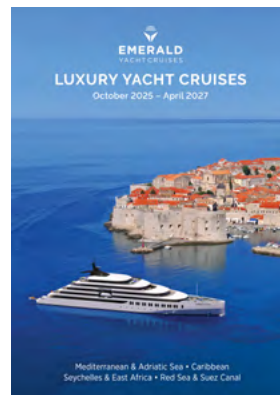
Mediterranean & Caribbean Luxury Yacht Cruising