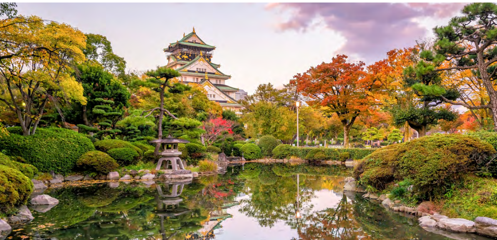
Osaka Castle, Osaka, Japan