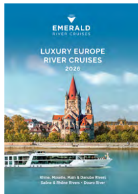
Europe River Cruising