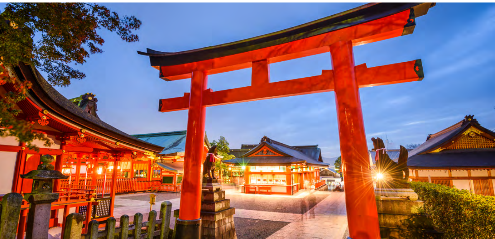
Fushimi Inari Shrine, Kyoto, Japan