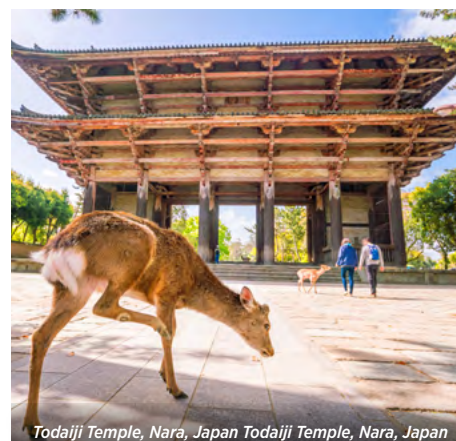
Todaiji Temple, Nara, Japan Todaiji Temple, Nara, Japan