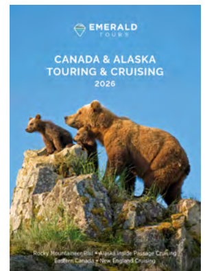
Canada & Alaska Touring & Cruising