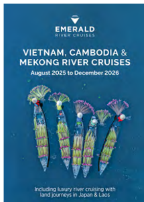
Vietnam, Cambodia & Mekong River Cruising