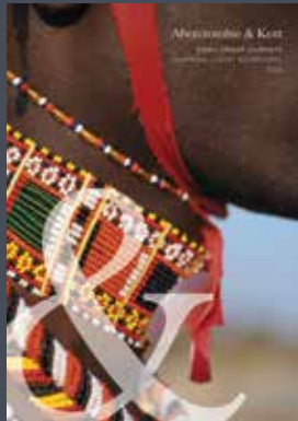
SMALL GROUP JOURNEYS