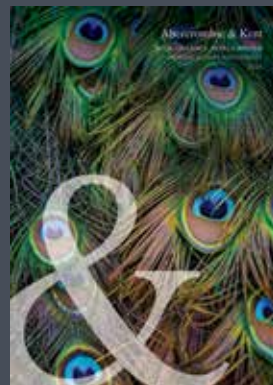
INDIA, SRI LANKA, NEPAL & BHUTAN