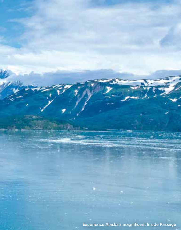
Experience Alaska's magnificent Inside Passage