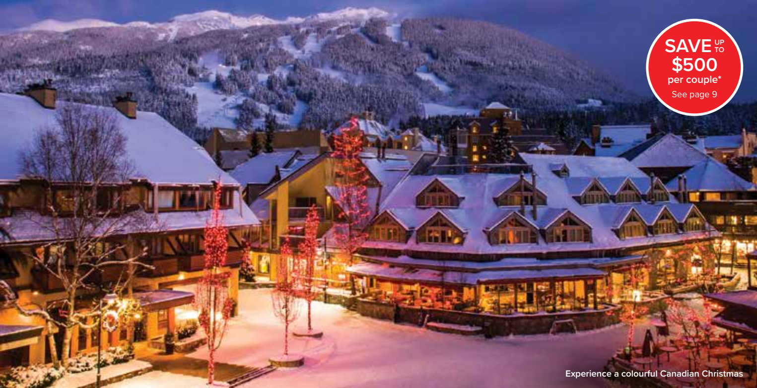
Experience a colourful Canadian Christmas