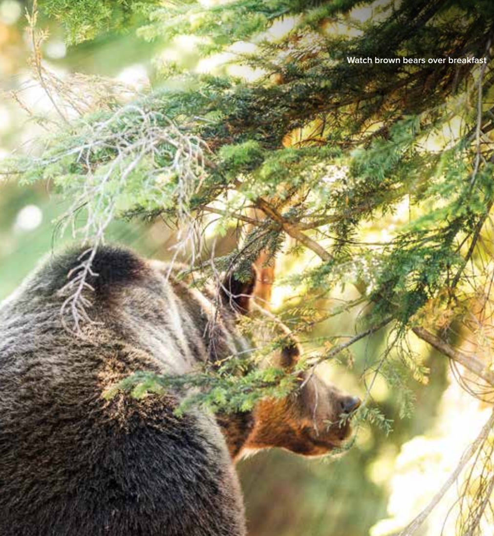
Watch brown bears over breakfast