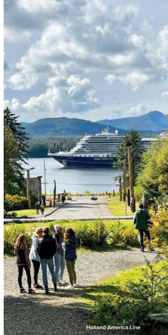
Holland America Line