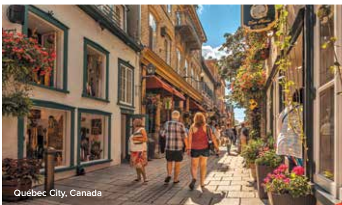
Québec City, Canada

Day 11. Banff Enjoy a free day to explore Banff at your own pace. Perhaps take a Bow River float trip, or a heli-flightseeing tour (own expense). B