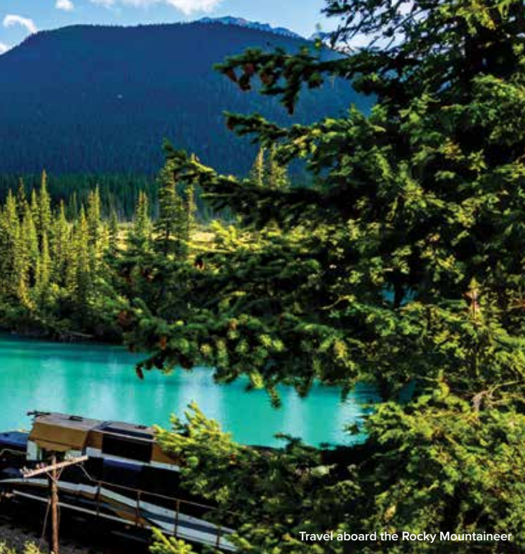
Travel aboard the Rocky Mountaineer