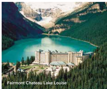
Fairmont Chateau Lake Louise