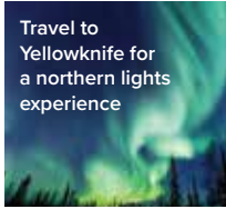
Travel to Yellowknife for a northern lights experience

Take a seat at nature's very own light show to view the northern lights. Search STONLW4 on travelmarvel.com.au for more information.