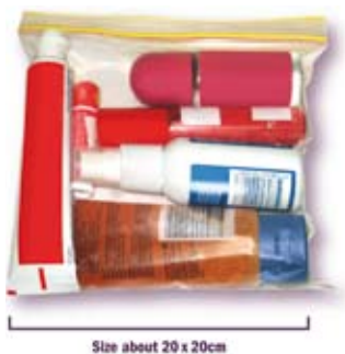
Pack items in a plastic resealable bag