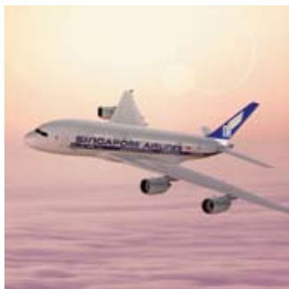
New rules for international flights