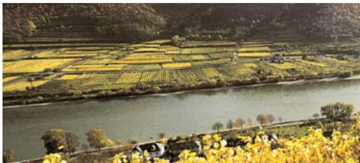
Europe boasts an extraordinary waterway system