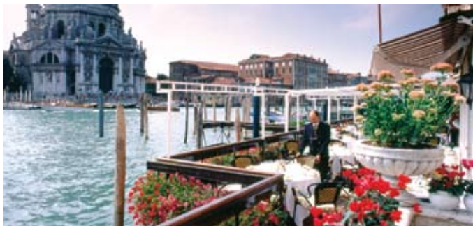
Dine amidst incredible scenery