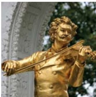
A statue of Johann Strauss in Vienna