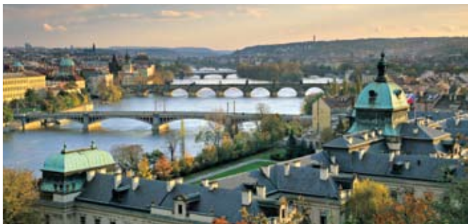
Discover the magical city of Prague