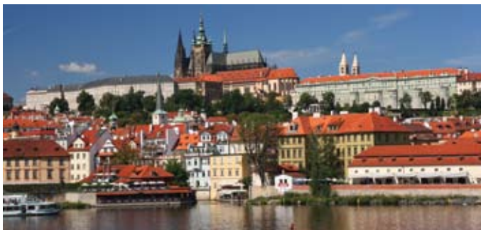
Admire the stunning architecture of Prague