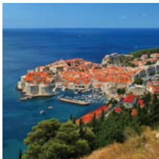
The stunning coastline of Dubrovnik