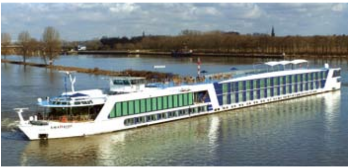
The luxurious ms Amadagio