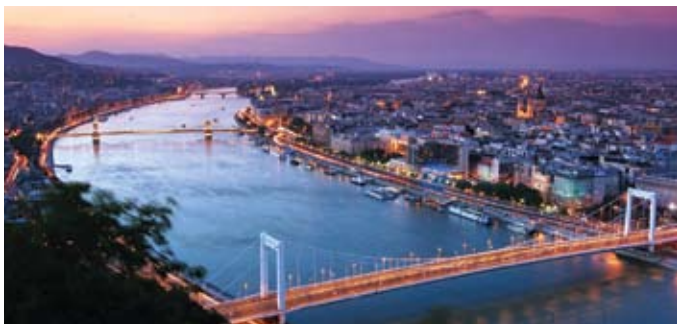
Cruising at dusk is a magical experience