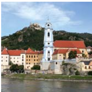
Cruise through Durnstein