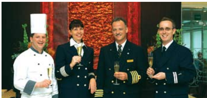
Your friendly and attentive crew

Tour buses are not equipped with wheelchair ramps and cabin doors are not wide enough to allow access by standard wheelchairs. Wheelchairs and walkers cannot be carried on tour busses, due to space limitations. Wheelchair passengers should be aware of these limitations. For safety reasons, passengers in wheelchairs cannot be carried on ramps in ports where the ship is at anchor.