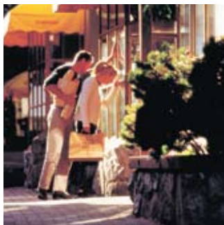
Discover Europe at your own pace