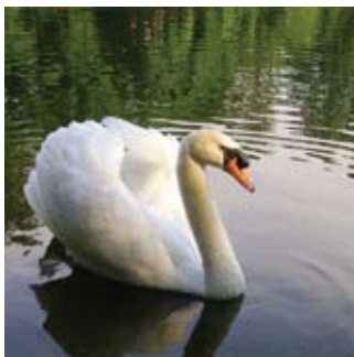
A swan in Koblenz