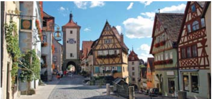
The medieval streets of Rothenburg