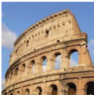
Take in iconic sights

work overseas. Most European ATM keyboards have only numbers, so if your PIN contains letters, make note of their corresponding numbers. Credit cards are widely accepted in European stores though some shops have a minimum spend amount. While travelling we suggest you carry some cash to pay for restaurant bills and other services. Be aware that after hours money exchanges and hotel receptions carry high commissions.